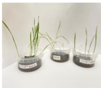
“Zhenis” wheat variety