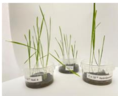
“Almaken” wheat variety